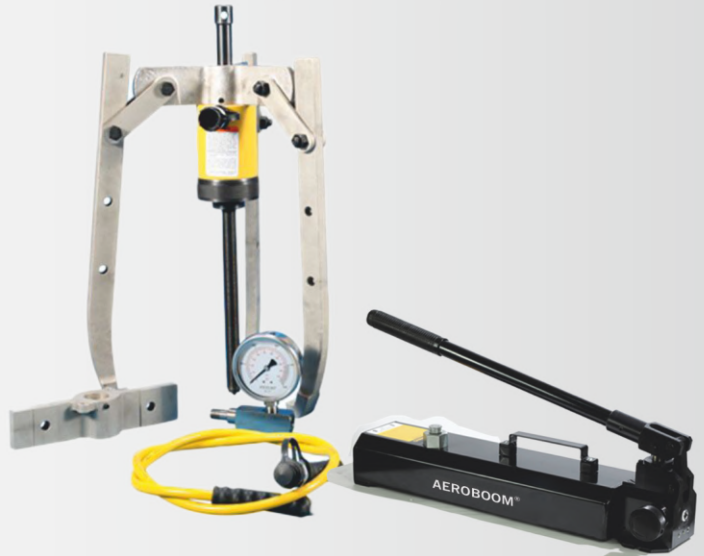
Shown: Grip Puller Set AHP-351G