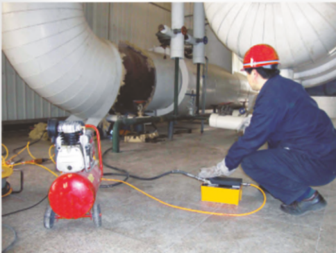
10000 PSI Air Hydraulic Pump Flow Rate