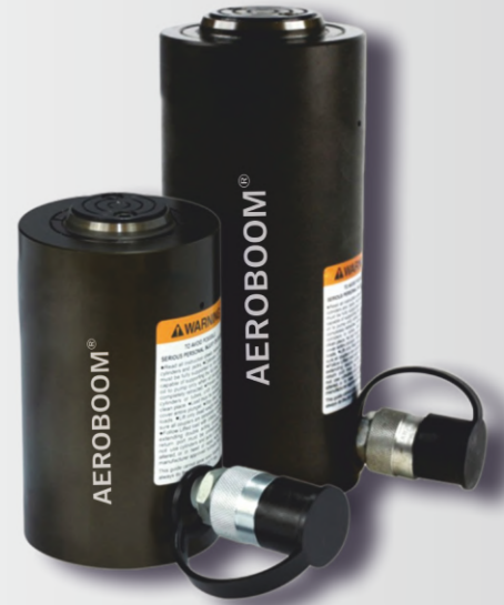
Show from left to right ARAC-202, ARAC-304